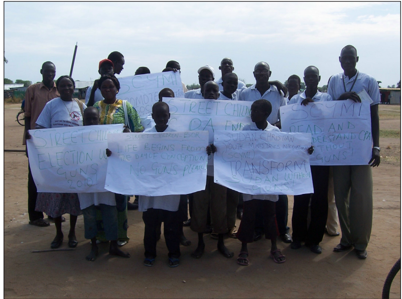
Street children and their advocates promote gun-free elections in South Sudan.