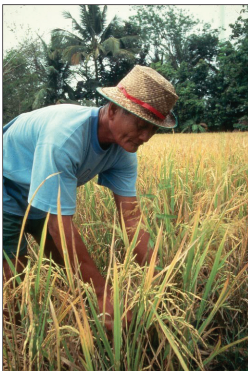
Photo of Filipino farmer

International law sets rules and regulations that end up causing harm to the less powerful developing countries due to an imbalance of power. Stiglitz objects to the intellectual property regime which, he says, "is shaped by pharmaceutical companies and entertainment industries." Investment agreements take away sovereignty and democratic accountability of the host countries while promoting the inter-