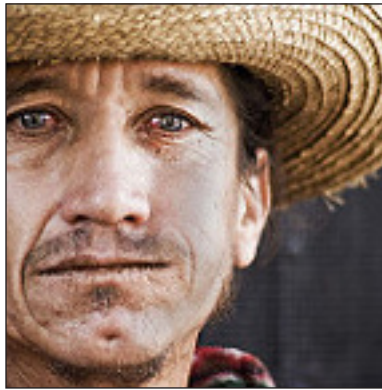
Protester for protecting the TIPNIS in 2012

MAS already declared Morales their 2019 candidate. It is still an open question whether or not he will win, which is why shoring up his base is so important. §