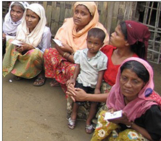
Rohingya Muslims, Myanmar, 2014

We thank Senators Gardner, Markey and Cardin for their leadership on SA 607 and urge all Senators to support this amendment to strike an embrace of this military at this time. [For a complete list of signatories, email ogc@maryknoll.org ]