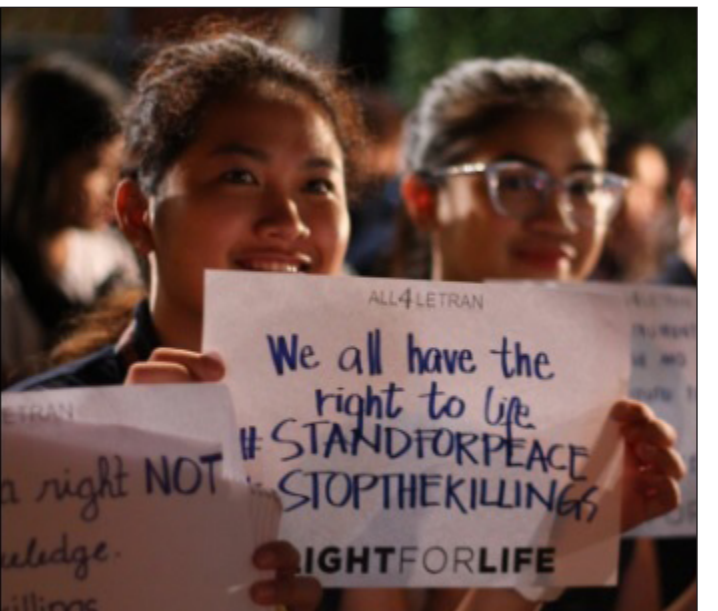
Students from Colegio de San Juan de Letran, a Dominican college in Mania, join the #LightforLife candle-light vigil in Manila on August 31, 2016.

Human Rights Watch described the hundreds of killings in the government's war on drugs as a "human rights calamity." "This is nothing less than an absolute human rights disaster," said Phelim Kine, deputy director for Asia, "The numbers are absolutely shocking."