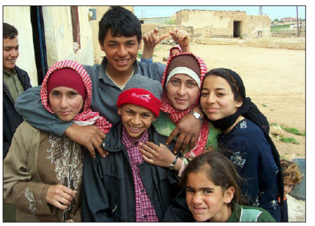
Bedu children in Aleppo, Syria.

Faith in action: Sign a petition by UNHCR asking UN member states to do their fair share for refugees at the UN Refugee and Migrants Summit on September 19: http://www.unhcr.org/refugeeday/us/petition/