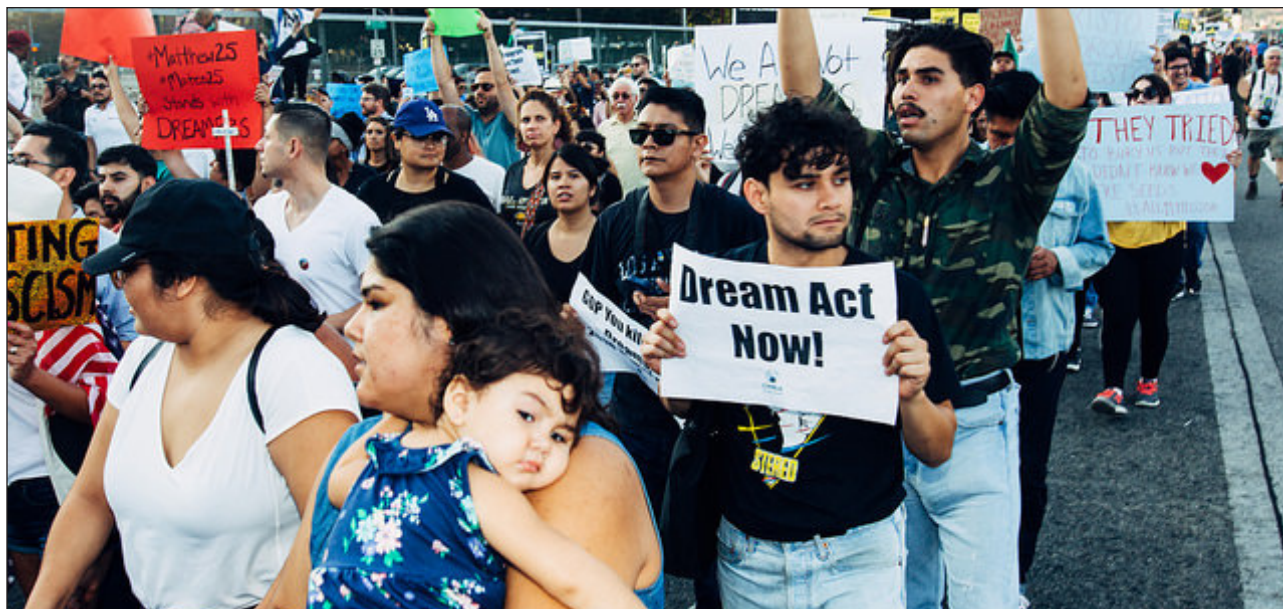
People march in the Defend DACA rally in Los Angeles, California, September 5, 2017.

In this moment of great moral decision, we look to Pope Francis, who in his address to Congress said: "We need to avoid a common temptation nowadays: to discard whatever proves troublesome. Let us remember the Golden Rule: 'Do unto others as you would have them do unto you' (Matthew 7:12)." We pray that you uphold the United States as a moral and just nation, and have the courage to show mercy and compassion and pass the 2017 Dream Act. §