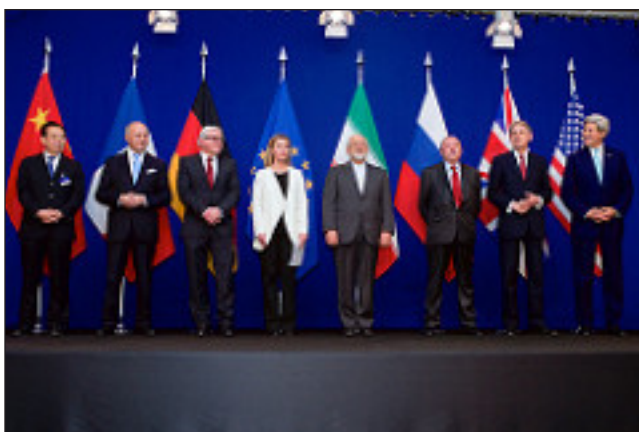
The ministers of foreign affairs from China, France, Germany, the European Union, Iran, Russia, United Kingdom, United States, Germany, and Iran while announcing the framework of a Comprehensive agreement on the Iranian nuclear program in Switzerland on April 2, 2015.

Faith in action: Tell Congress that the U.S. should remain in the Iran nuclear deal. http://bit.ly/IranNuclearAccord .