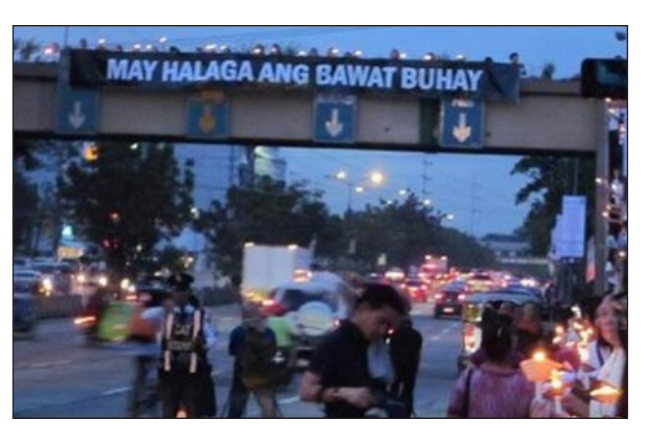
May halaga ang bawat buhay ("Every life has value") sign hanging at a prayer vigil for the victims of President Duterte's war on drugs in the Philippines on September 26.

Meanwhile, on October 13 in Geneva, Pax Christi International and Franciscans International expressed their grave concern for these human rights abuses to the UN Human Rights Council. They called on the international community to push for impartial investigations and they called on the government of the Philippines to seek nonviolent solutions to the problem of drugs and crime and to build a culture of peace.§