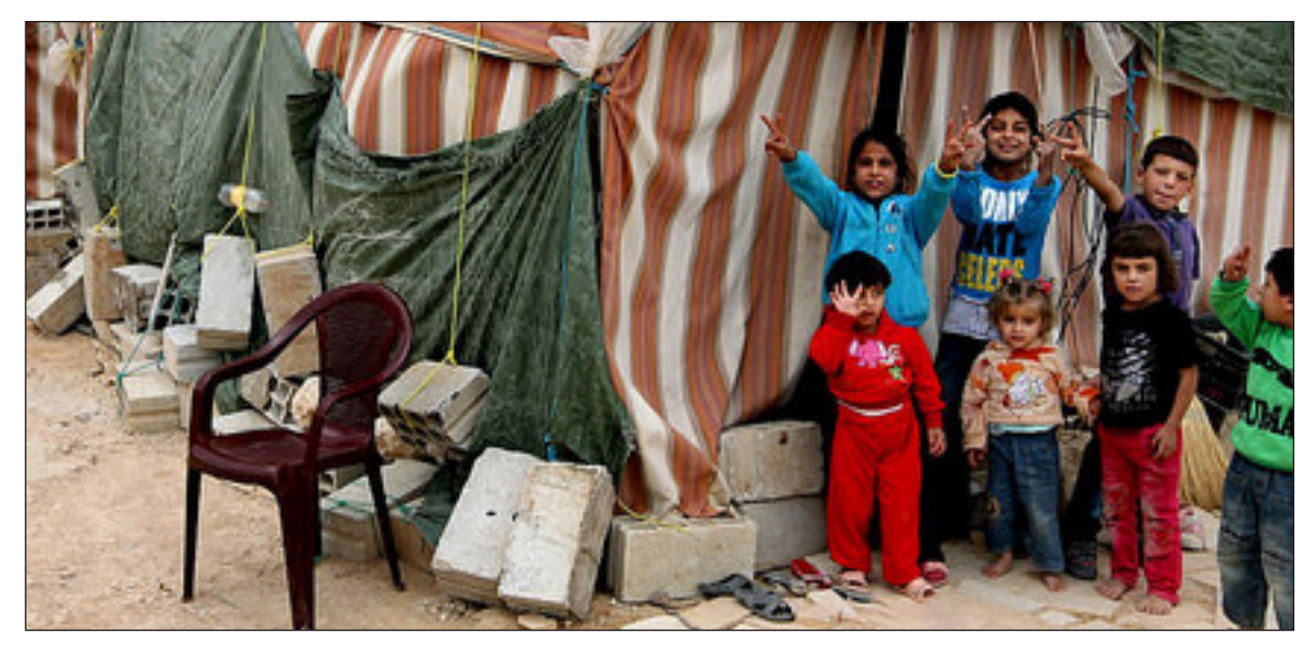
Syrian children wave peace signs on October 2 as they stand in front of their tents at a refugee camp in Arsal, a Sunni Muslim town in eastern Lebanon near the Syrian border. The town has become a safe haven for war-weary Syrian rebels.

Faith in action: The United Nations Refugee Agency (UNHCR) UNHCR offers a petition to governments to act in solidarity and a 5-minute film based on a poem entitled 'What They Took With Them' by Jenifer Toksvig, inspired by first person testimony from refugees of items they took with them when they were forced to flee. http://www.unhcr.org/refugeeday/us/