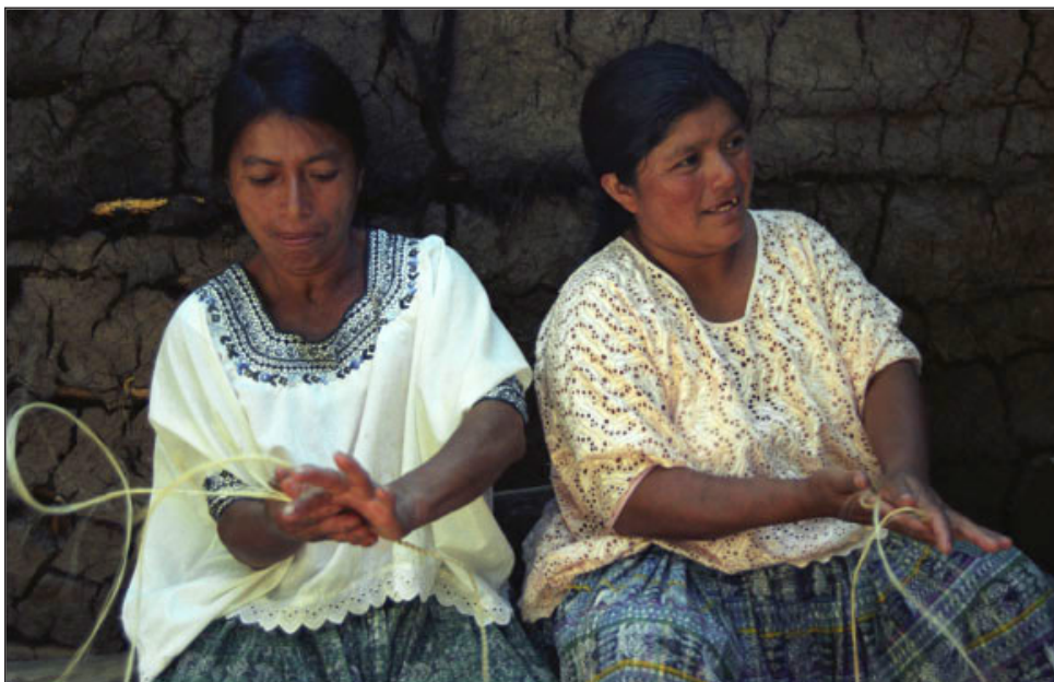
Photo of Guatemalan women

benefit multinational corporations, the economic aid part of the plan is more of the same neoliberal approach to the economy that is always required of these countries. For example, El Salvador's government is being forced to open its contracts to international business as a precondition to receive Millennium Development Goal funds, which negatively affects local businesses and the capacity of the government to hire locally. In Honduras,