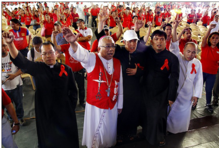
Archbishop Ramon Arguelles of Lipa leads a prayer rally against coal-fired power plants in Batangas City on March 17.

Other protest activities are also scheduled until May 15 in other countries, which include Indonesia, Nigeria, Brazil, the United