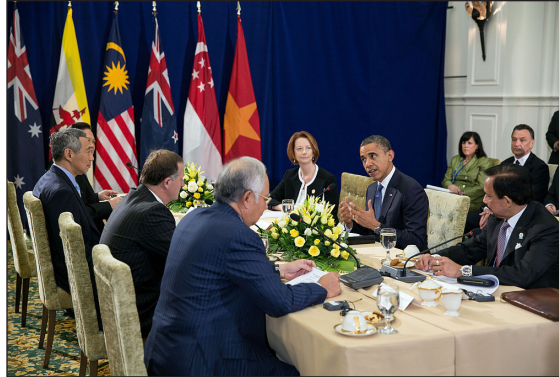
President Obama at TPP meeting, November 2012

A 17th round of talks is currently scheduled for May in Peru; negotiations are formally scheduled to conclude this year. §