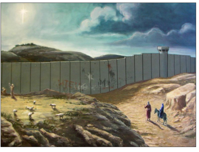
"Nativity Wall" believed to be painted by the controversial British graffiti artist Banksy in 2005.