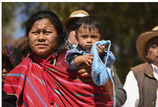
Pope Francis joined thousands of Mexico's indigenous people in celebrating Mass in three languages native to them on February 15.

world leaders to care for the more than 60 million migrants around the world. He said they should measure this tragic global phenomenon not by numbers and statistics, but by names and stories and families, and that those running from danger should not be criminalized. "They are 'cannon fodder,' persecuted and threatened when they try to flee the spiral of violence and the hell of drugs," he said. "Let us together ask our God for the gift of conversion, the gift of tears, let us ask him to give us open hearts like the Ninevites, open to his call heard in the suffering faces of countless men and women. No more death! No more exploitation! There is still time to change, there is still a way out and a chance, time to implore the mercy of God." §