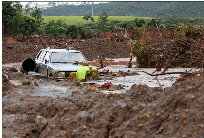
An abandoned car in the village of Bento Rodrigues in November.

Unfortunately, Maryknoll missionaries hear stories of suffering due to environmental disasters in many countries. The fundamental driver behind so much destruction is humanity’s tendency to consume more and more. Mines like this only exist to satiate this demand. Cellular phones, computers, even solar panels and wind turbines are made of metals dug up in mines around the world, all too often in precarious and dangerous conditions. §