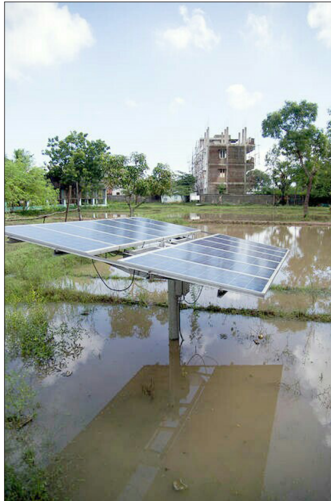
Small-scale solar panels at the organic Nallayan (Good Shepherd) Farm in India's southernmost state of Tamil Nadu provide energy for water pumps, lights, and other applications. Photo: Flickr/PWRDF and licensed in the creative commons 2.0.

Congress and other nations' legislatures consider improving the TPP, they will also need to consider whether they want to protect and grow local jobs for a clean energy future. §