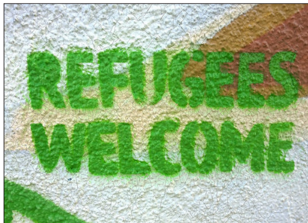
“Refugees welcome” graffiti in Dresden, February, 2016.

When given the opportunity to respond to the panelists, a representative of a civil society organization reminded us all that refugees, migrants and asylum seekers are our brothers and sisters; and all visitors to the United Nations are greeted by a mosaic based on a work by American artist Norman Rockwell entitled “Golden Rule.” The art work depicts people of different nationalities standing together with the words “Do unto others as you would have them do unto you” inscribed on the surface. §