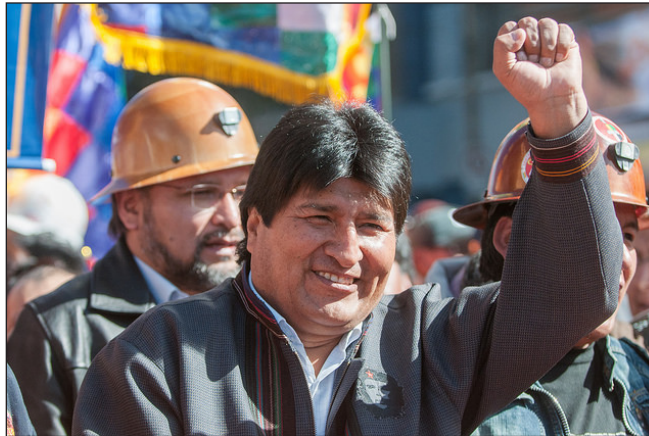
President Morales leads a march of the Central Obrera Boliviana, the largest union of Bolivia, in 2013.

country well, as long as they have the capacity to be a government for all, to compromise in the interest of the common good. They cannot be a kitchen cabinet outside of the government. Rather, they must work within the messy process called democracy. When President Morales took office in 2006, the MAS party was not prepared to govern like that and has paid the price of losing some of its most talented supporters. The MAS party now has four years to build on the good they have done and serve the long-term interests of the country, or flounder under the pressure of disagreement. §