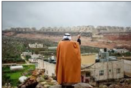
The village of Wadi Foquin.

Mayor Sokar showed pictures of a playground in his village that Israeli authorities ordered closed. Meanwhile, within view is a much larger playground for the children of Beitar Illit which the government has allowed to remain open. Additional expansion plans for the settlement include confiscation of the only road to access Wadi Foquin.