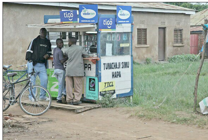
Mobile phone store in Sumbawanga, Tanzania.

South Sudan joins the East African Community: On March 2, the East African Community, a regional economic federation, welcomed South Sudan as its newest member. This decision by Uganda, Kenya, Tanzania, Rwanda and Burundi has both economic benefits and historical significance. §