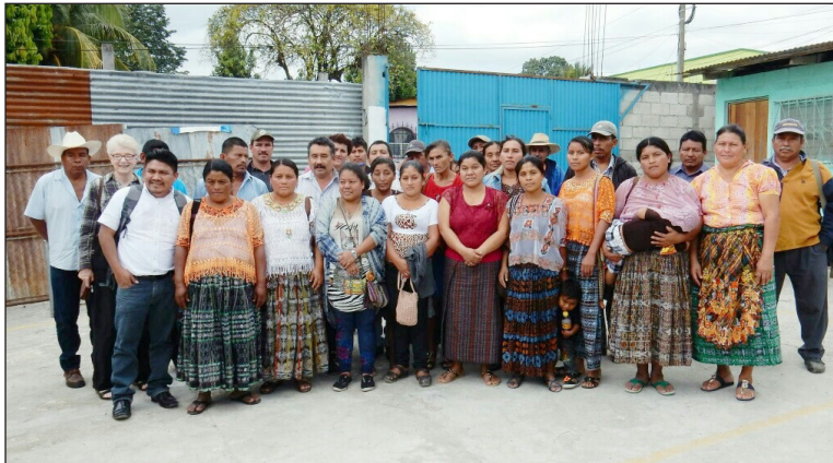
Members of the indigenous community of Sayaxche.

Palm oil companies have cultivated more than 80 percent of the land surrounding and in the town of Sayaxche. The production of edible palm oil is a large monoculture process that uses large quantities of water and toxic pesticides, and is destructive to the soil. Palm oil production has taken over and rendered infertile land