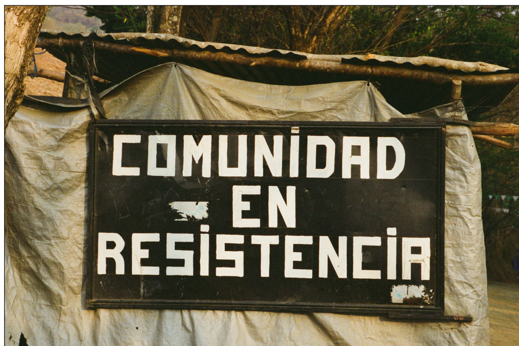
Photo of sign from La Puya

Whether the case of gold mining at La Puya, silver mining in San Rafael, or nickel mining in El Estor, years of sustained community resistance show no signs of relenting. Meanwhile, transnational mining companies that benefit from government corruption and entrenched impunity, disregarding basic human rights obligations to increase profits, should perhaps not be so confident they will get away with it.