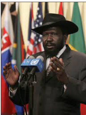
Roman Catholicism is the largest Christian denomination in South Sudan; President Salva Kiir, left, is a Catholic.

In the conclusion, the bishops declare that: “We are convinced that we stand at a decisive moment in the history of South Sudan. Fundamental choices must be made about how we deal with our past and present history, about how we govern ourselves as a nation, about how state institutions serve the poor. We must seize from the present crisis an opportunity to re-found our nation on democratic principles of dialogue, inclusion, and respect for diversity, God’s gift to humanity.”