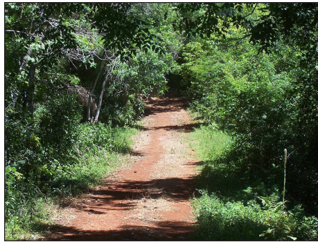
Photo of Los Misiones, Leandro Kibisz, available under the Creative Commons Attribution-Share Alike 2.5 Generic license.

Learn more about this campaign at www.responsibleharvard.com and search for "Harvard in Ibera."