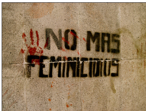
“No more femicides.”

The issue of these killings goes far beyond isolated incidents of violence against sex workers. So many murders occurring in the space of less than a month seems to indicate that perpetrators of violence against women and LGBTI individuals are secure in their impunity. In fact, civil society groups reported that at least 606 women were killed in 2012, the highest rate of femicide in Honduras since 2005, indicating that Honduran government is not accomplishing its mission of protecting vulnerable members of society.