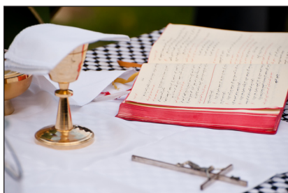
Altar in Palestine

REMHI (Recovery of the Historic Memory) process. [See Guatemala: Never Again! Orbis, 1999] In the U.S. at Fort Benning, Georgia each year a solemn litany of remembrance ties the suffering of people throughout the Americas at the hands of U.S-trained soldiers to the cross of Christ.