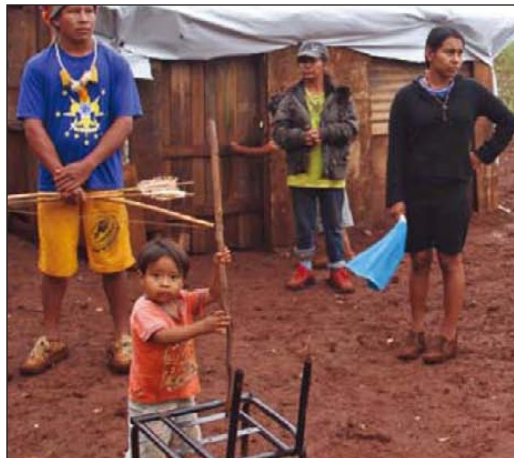
An indigenous family displaced from their land by the expansion of agribusiness in Mato Grosso do Sul, Brazil.

"This global land grab is a massive transfer of vital food producing resources from poor rural communities to wealthy global elite. Through these deals, families and communities are losing their farms and forests, while farming and pastoral systems that produce food for local people are being wiped out to make way for industrial plantations producing food for export. Many of these land deals are happening in countries where food insecurity and access to land and water are already at critical points. The people who are dispossessed of their lands or affected by the new large-scale plantations are rarely consulted, as many of the deals are negotiated and signed between foreign investors and government officials behind closed doors. With so much at stake, it is no wonder that protests are erupting in many areas where the lands are being grabbed, at times resulting in violent clashes and even deaths."