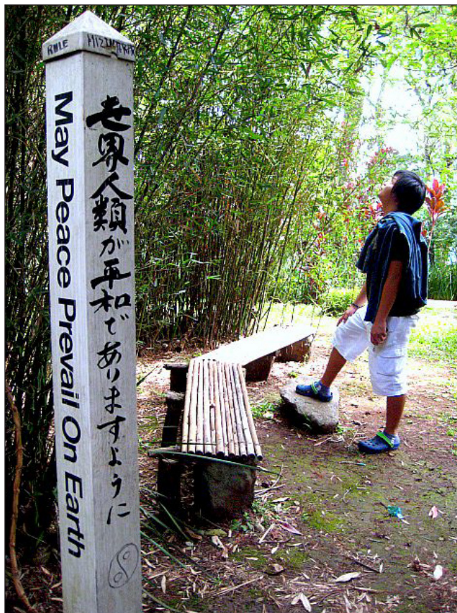
Peace pole at the Maryknoll Ecological Sanctuary in Banguio City, Philippines.

The hope is that Goal 13 of the SDGs will empower member states to take action based on the Paris agreement. In particular, we need intense education programs at all levels of society, as well as institutional capacity-building measures that enable countries to transform into cleaner, more resilient economies. §