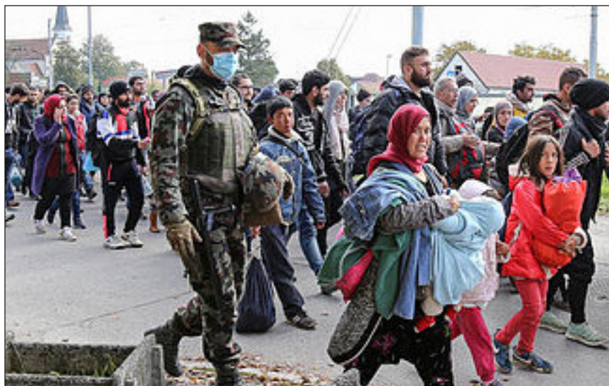
Syrian refugees pass through Slovenia on their way to Germany, October 23, 2015.

Further, we strongly urge your support for the diplomatic efforts being made in Vienna to de-escalate the violence in Syria, which will be a