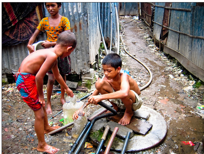
Children gather water in Dhaka, Bangladesh.

To read the article in its entirety, go to http://www.ucanews.com/news/displaced-poor-bear-brunt-of-climate-change/74727 .