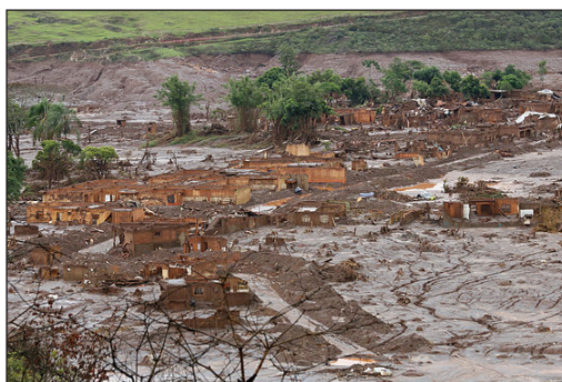
The town of Bento Rodrigues after the disaster.

There are safer ways to store or dispose of the refuse from mines, but they are more expensive than tailings ponds and companies will not use them on a large scale unless required. With already weakened economies, few governments are likely to pass laws that will make their minerals more expensive internationally. §