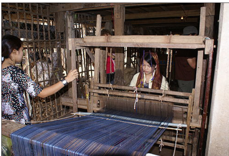
A woman at the weaving loom near Chau Doc, Vietnam

The Maryknoll Office for Global Concerns, through the Interfaith Working Group on Trade and Investment, will share more of what is inside the TPP trade deal in a three-week webinar series starting in late January. Register for the series at maryknollogc.org . §