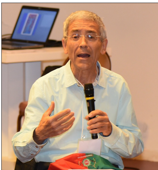
Jesuit Father Francisco de Roux of Colombia at the Nonviolence and Just Peace Conference in Rome in April 2016.

Father Francisco concluded, "I am certain that because of the generosity of my companions, women and men, and due to the way they devoted themselves to protect life and dignity in extreme difficulties, [our peace] process became a reference, in the construction of structural peace, all the while threatened by terrible violence; and the process has been replicated, so that we have now twenty four programs of development and peace in different regions of Colombia."§