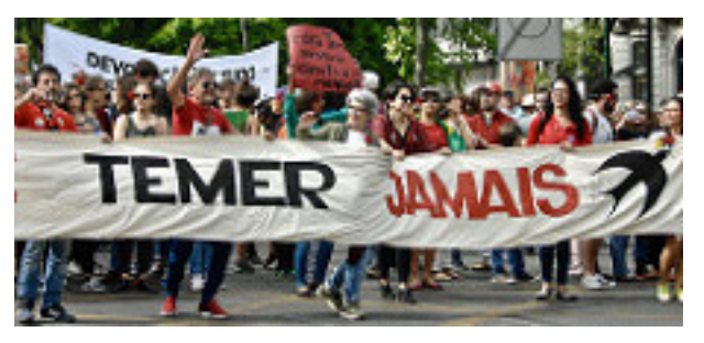
A protest against the policies of President Michel Temer, April 25, 2017.

ket" an income supplement program for poor families. These bonuses for businesses will total an estimated R$224 billion (US$69 billion), seven times the Bolsa Family program. In addition to benefits for domestic firms, Temer recently voided taxes for foreign petroleum companies working in the offshore oil fields that he recently sold in a controversial move. The loss in taxes