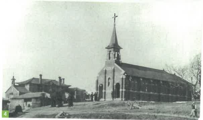
4 Maryknoll Fathers and Brothers Center and Sacred Heart Cathedral in Pyongyang taken in 1933