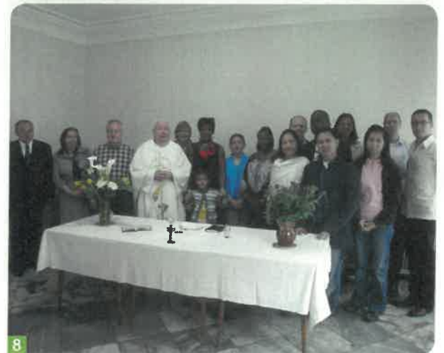
8 A Mass for the foreign diplomatic community in Pyongyang – May 2010