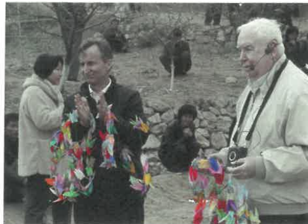
Distributing paper-crane necklaces at a graduation ceremony for patients who have completed the eighteen months of treatment - Spring 2014