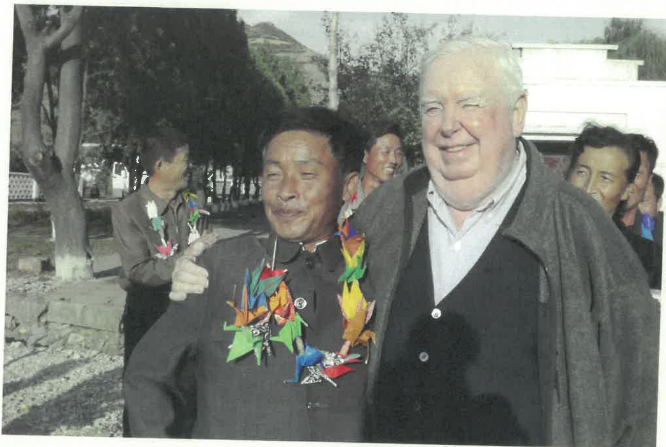
At a 'graduation ceremony' marking completion of eighteen months of treatment – Autumn 2013