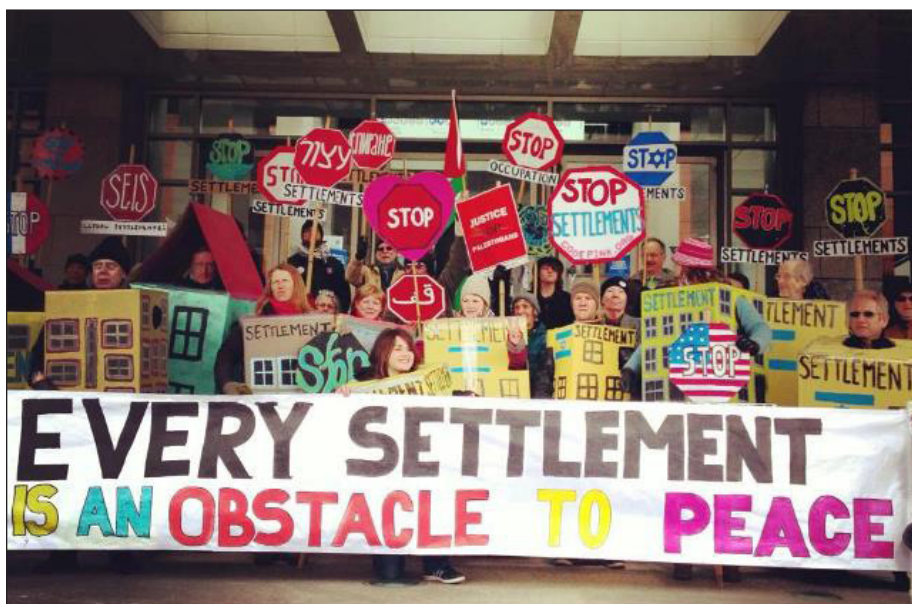
Photo of activists outside AIPAC conference

Pax Christi International will therefore support new initiatives by international civil society towards the end of Israel’s settlements policy and the active ban of Israeli settlement products. §