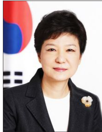
Pres. Park Geun-hye, South Korea

Besides rewards for North Korea and South Korea to reconcile, the Obama administration needs to offer incentives and rewards for China to welcome a unified Korea on its border and to leverage its position as supplier of 90 percent of North Korea’s energy. China dislikes a North Korea with nuclear arms more than it dislikes a unified Korea.