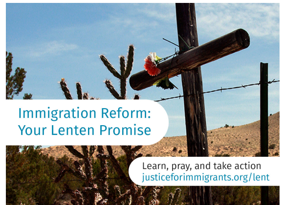
Example Facebook Timeline Image

For ideas on how to use social media resources and to stay up to date on immigration news, connect with JFI online.